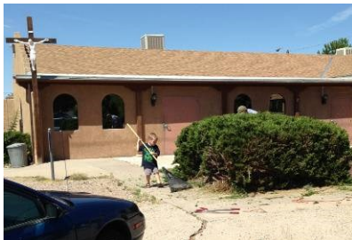
3 year-old future student raking the grounds