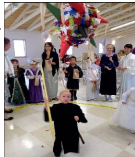
"St. Benedict" crushes vices

November 1, the feast of All Saints, was a day of celebration. The morning Mass on this feast day was followed by a party in which NSLCA students and other children dressed as little saints. The party incorporated a few games and a visit to the elderly in a nearby nursing home. The party finished with the smashing of the piñata, whose seven cones represented the seven capital sins.